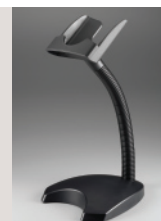
> AS-8120 stand