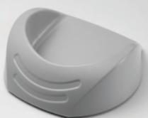
> AS-8000 holder