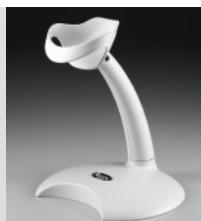
> AS-8000 stand